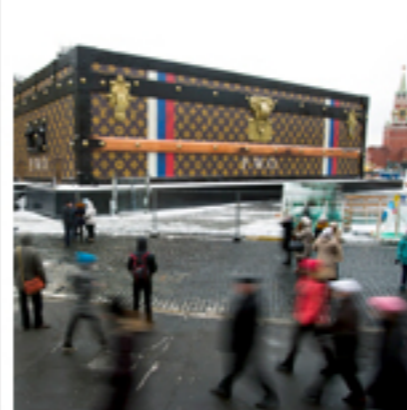
Louis Vuitton May Not Go With Red Square