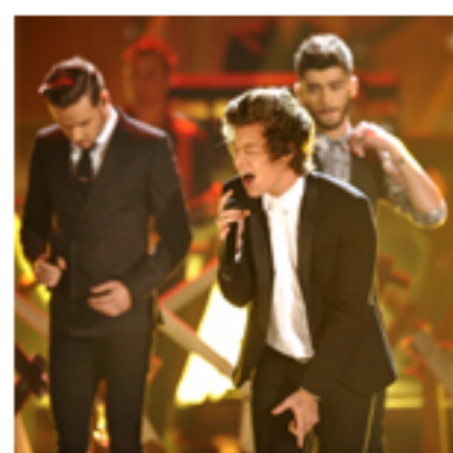
Heading Wherever, Together