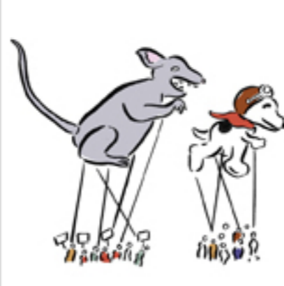
Op-Art: Late to the Parade