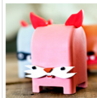
A Talking Mailbox That Grows