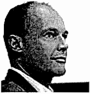
Bertrand Piccard, Chairman, Solar Impulse, Switzerland

International Conference Centre Geneva, Switzerland