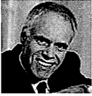
Moritz Leuenberger, Swiss Federal Councillor, Head of the Federal Department of the Environment, Transport, Energy and Communications

International Conference Centre Geneva, Switzerland