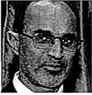
Gholam Hossein Nozari, Minister of Petroleum, Iran

International Conference Centre Geneva, Switzerland