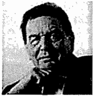
Gerhard Schröder, Chairman, Energy Pact Conference, Former Chancellor of Germany

Gerhard Schröder was born in Germany in 1944. He is the former Chancellor of the Federal Republic of Germany (1998-2005). From 1966 to 1971 he studied law at the University of Göttingen. From 1972 onwards, he served as an assistant at Göttingen University. In 1976, he passed his second law examination and worked as a lawyer until 1990. Schröder joined the Social Democratic Party in 1963. In 1986, he was elected to the parliament of Lower Saxony and became leader of the SPD group. After the SPD won the state elections in June 1990, he became Minister-President of Lower Saxony as head of an SPD-Greens coalition; in this position, he also won the 1994 and 1998 state elections. Following his election as Minister-President in 1990, Schröder became a member of the board of the federal SPD. In 1998 he was elected to Federal Chancellor of the Federal Republic of Germany. He was re-elected in 2002. From 1999 to 2004 he served as Party Chairman for the SPD. In 2005, he became a Councillor for Ringier, a Swiss media company. He is currently Chair of the Shareholder's Committee of Nord Stream, Independent Director of Anglo-Russian oil company TNK-BP and Member of the Board of Directors, and Member of the European Advisory Council of the Rothschild Group."