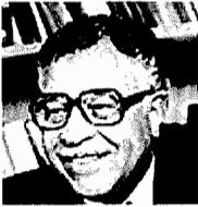
Mostafa Tolba, Former Executive Director of the United Nations Environment Program, Egypt