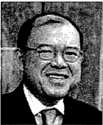
Supachai Panitchpakdi, Secretary-General of UNCTAD

Moritz Leuenberger was born in Biel on 21 September 1946. Following his law studies in Zurich he ran a legal practice there until 1991. Between 1972 and 1980 he was president of the city's Social Democratic Party and was a member of the city parliament from 1974 to 1983. Moritz Leuenberger was elected to the National Council in 1979 and was a member of Zurich's cantonal government from 1991 to 1995. Since his election to the Federal Council on 27 September 1995, he has headed the Federal Department of the Environment, Transport, Energy and Communications (DETEC). Moritz Leuenberger first served as President of the Swiss Confederation in 2001 and held the office again in 2006. Leuenberger's main political focus has been on developing sustainable transport and climate policies. His efforts to transfer goods traffic from the roads to the rails earned him an honorary doctorate from the University of Udine in 2001. In order to reduce Switzerland's CO 2 emissions, parliament approved an incentive tax on fossil fuels, which entered into force at the beginning of 2008.