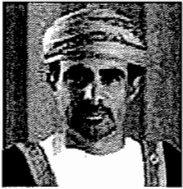
Mohammed Hamed Al Rumhy, Minister of Oil and Gas, Sultanate of Oman

Gholamhossein Nozari was born in 1954 in Kazeroon, Iran. He is currently the Minister of Petroleum of Iran (since November 2007). He holds a BS in Petroleum and Earth Science Engineering from Shahid Chamran University, Ahwaz and an MA in Management from Tehran University. During his career, he held many positions: he was a Member of Recruitment, Director of the National Iranian South Oil Company (NISOC), Manager of Production, Expansion Schemes, Petroleum Engineering and Development Company. He sat on several boards: he was a Member of the Board, Director of the Petroleum Engineering and Development Company, Chairman of the Board, Director of the National Iranian Drilling Company (NIDC), Chairman of the Board, Director of the North Drilling Company, Managing Director of the Iranian Central Oil Fields Company (ICOFC) and Member of Parliament, Vice Chair of the Energy Committee (1992-96). He served as Deputy Minister of Petroleum and Managing Director of National Iranian Oil Company (NIOC). He was Acting Minister of Petroleum between August and November 2007.