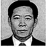
Yang Dongliang, Executive Vice Mayor, Tianjin, China

International Conference Centre Geneva, Switzerland