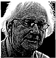
Johan Galtung, Professor of peace studies, Founder of TRANSCEND, Norway