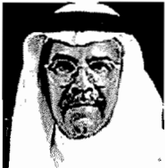
Ali Al-Naimi, Minister of Petroleum and Mineral Resources, Saudi Arabia