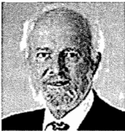
Ernst Ulrich von Weizsäcker, Co-Chair, International Panel for Sustainable Resource Management, Germany