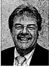
Pierre-François Unger Counsellor of State, Department of Health and Economy

International Conference Centre Geneva, Switzerland